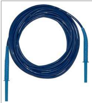
Measurement lead MCABLE-10m-blue (Z555R)