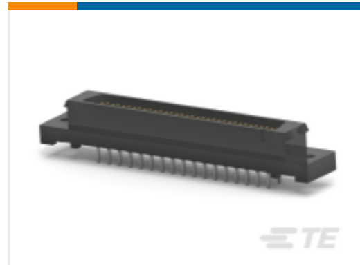
TE Part #2-5174339-5 D-Sub Plug Assembly: Standard, Vertical, 1.27mm