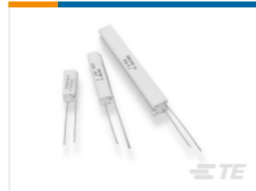
TE Part #1623730-1 Wirewound Resistor: Vertical Mount