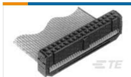
TE Part #1658622-5 24 NOVO MIL/CTR 30DP,LEAD FREE