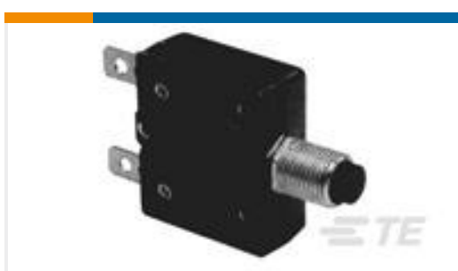
TE Part #1423674-2 W54-XB1A4A10-5=CKTBKR,THERM,PB