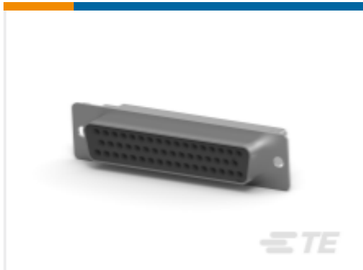
TE Part #1658640-1 D-Sub Crimp Recept Signal 50 Posn, Socket Size 20, Shell Size 5