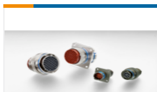
TE Part #YAFD56-24-61SNC127 PLUG ASSY