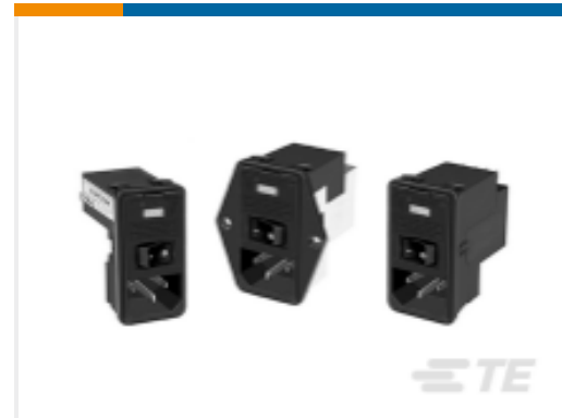
TE Part #1-6609103-0 CORCOM P SERIES MULTI- FUNCTION INLET FIL