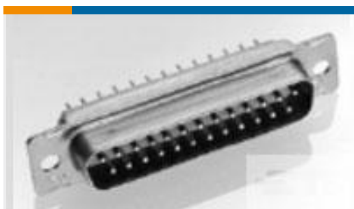
TE Part #1757823-5 AMPLIMITE,ASY,PLUG,STD,90,ZN,5