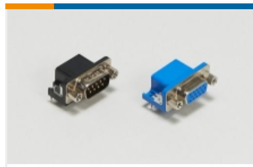
PCB D-Sub Connectors(196)