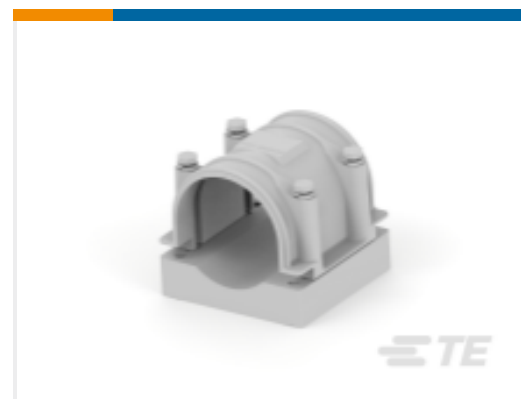
TE Part #K1000090 Flange Special Typ 26-50-00