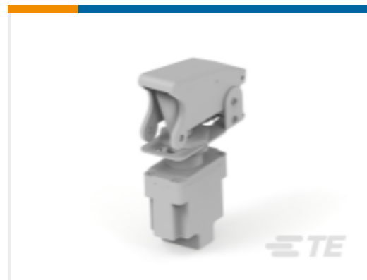
TE Part #K1003006 Switch guard 08-0-0-03