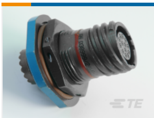
TE Part #YDTS24Z11-98PAV001 RECP ASSY