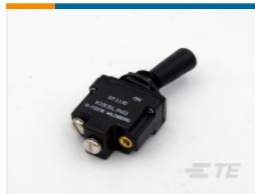
TE Part #K1007153 Toggle Switch 1-Pole, Sealed, Lever, Toggle, Plastic Lever