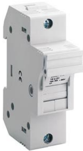
BUILT-IN FUSE BASE FOR CYLINDRICAL FUSES SIZE 14X51MM 50A, 1POLE