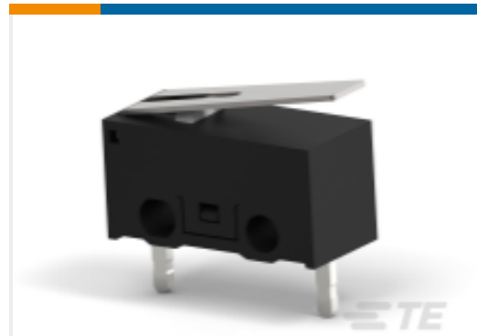
TE Model / Part # 2351445-2 UMINSA SW HLEV 0.74N 0.1A/30VDC NC PCB