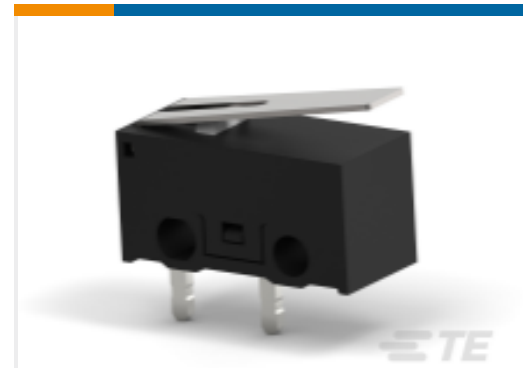
TE Model / Part # 2351445-3 UMINSA SW HLEV 0.74N 0.1A/30VDC NO PCB