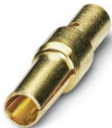
Crimp contact, turned, Single contact, contact diameter: 1 mm, crimp range: 0.14 mm 2 ... 0.56 mm 2

Please be informed that the data shown in this PDF Document is generated from our Online Catalog. Please find the complete data in the user's documentation. Our General Terms of Use for Downloads are valid ( http://phoenixcontact.com/download )