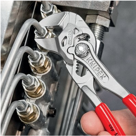
the mini pliers wrench for precision mechanics