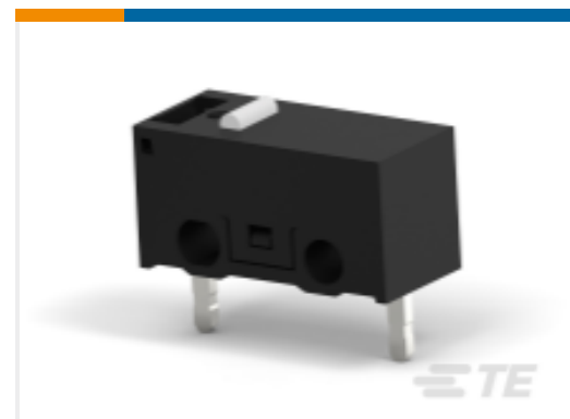
TE Model / Part # 2351444-2 UMINSA SW PPLUN 0.74N 0.1A/30VDC NC PCB