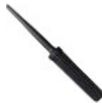
Probe Adjust Tool