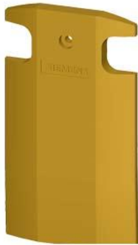
COVER YELLOW, FOR POSITION SWITCH METAL 3SE51, HOUSING TO EN50041