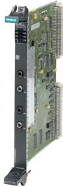
SIMATIC TDC communication module CP 53M0 Rack coupling TDC <--> SIMADYN