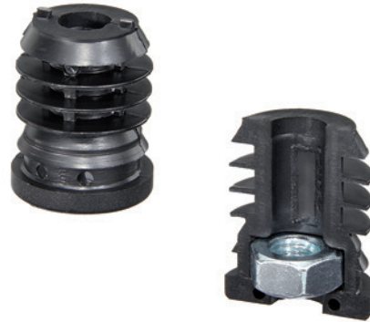
NDL.T-20 ÷ 40