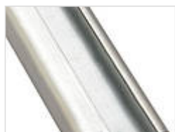
DIN rails DIN EN 60715 G 32, galvanised steel