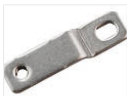
Wall brackets, screw-on at rear