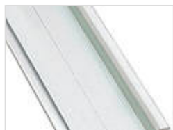
DIN rails DIN EN 60715 TH 35, galvanised steel