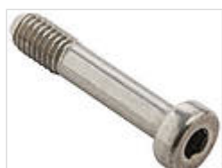
Allen cheese-head screw for lid