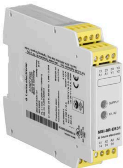
Part no.: 50133022 MSI-SR-ES31-01 Safety relay