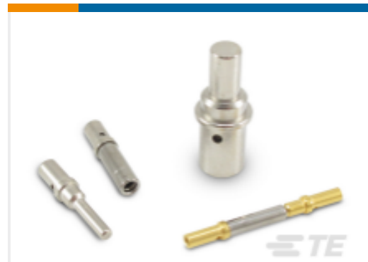
TE Part #0460-202-16141 DEUTSCH SOLID CONTACTS