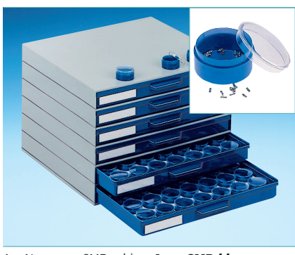
Art. No. SMD cabinet A 1-1 SMD blue