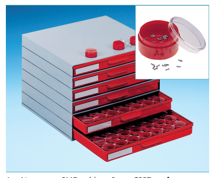
Art. No. SMD cabinet A 1-1 SMD red