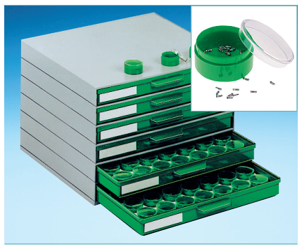
Art. No. SMD cabinet A 1-1 SMD green