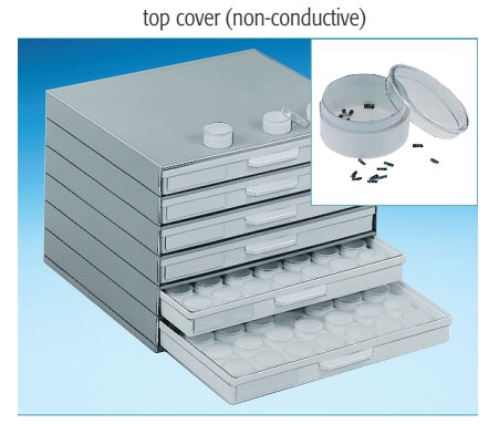
Art. No. SMD cabinet A 1-1 SMD white