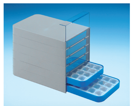
Art. No. A 1-3 SMD for 6 pcs V 11-5 (without top cover) Art. No. A 1-3 SMD NORMAL