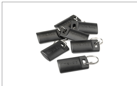
TimeMoto RF-110 set of 25 RFID key fobs Art.no: 125-0604