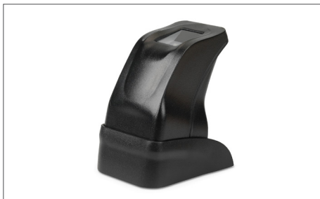
TimeMoto FP-150 USB Fingerprint Reader Art.no: 125-0606