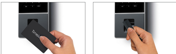
Clocking in/out with Fingerprint, RFID badge or PIN