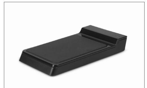
TimeMoto RF-150 USB RFID Reader Art. no: 125-0605