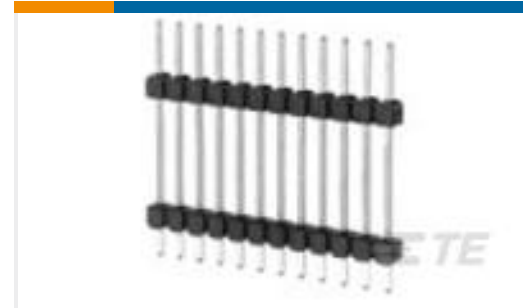
TE Part #6-146459-4 14 MODII HDR SRST UNSHRD STKG