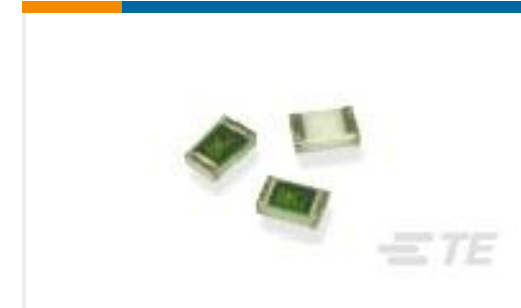
TE Part #5-1676274-4 RN 0805 27K 0.1% 10PPM 1K RL