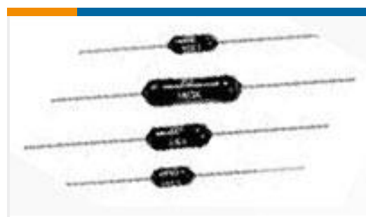
TE Part #8-1879642-3 H8 1K11 0.1% 5PPM