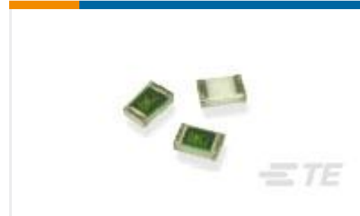
TE Part #1614379-5 RN 0805 12K 0.1% 10PPM CUT LENGTH