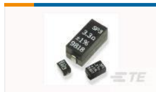
TE Part #1-1624317-0 SP3 22R1 1% TAPED