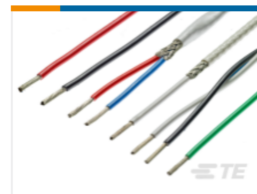
TE Part #670713-000 44A0141-16-MST4CS2275