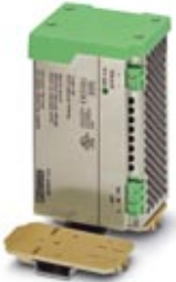
Adapter for mounting QUINT-POWER power supply units, 1 A, 2.5 A, and 5 A, at a 90° angle to the DIN rail

Please be informed that the data shown in this PDF Document is generated from our Online Catalog. Please find the complete data in the user's documentation. Our General Terms of Use for Downloads are valid ( http://phoenixcontact.com/download )