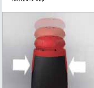
Bit magazine opens at the press of a button.