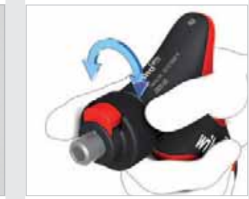
Finely toothed, switchable ratchet