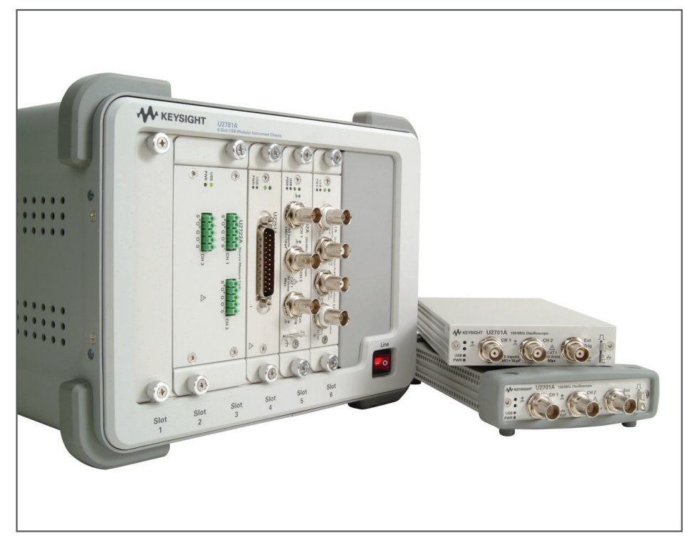
Figure 1. The dual-play capability allows the U2701A/U2702A USB modular oscilloscope to be used as a standalone unit or as part of test system in a cardcage.

The U2701A/U2702A USB modular oscilloscopes are equipped with High-Speed USB 2.0 interface for easy setup and plug-and-play. This ease of use makes the oscilloscopes ideal for the education, design validation and manufacturing industries.