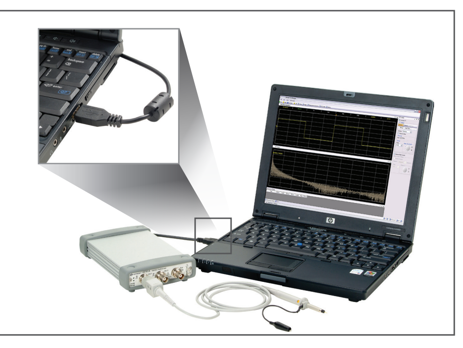
Figure 2. The U2701A and U2702A connect to the computer or laptop with a USB cable, enabling fast data transfer.

The U2701A and U2702A USB modular oscilloscopes offer analysis functions such as addition, subtraction, multiplication, division, and Fast Fourier Transform (FFT). FFT allows you to manipulate the waveform using five types of windows such as Hanning, Hamming, Blackman-Harris, Flattop, and Rectangular.