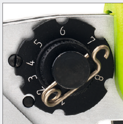
Crimp indenter depth setting through an 8 position selector