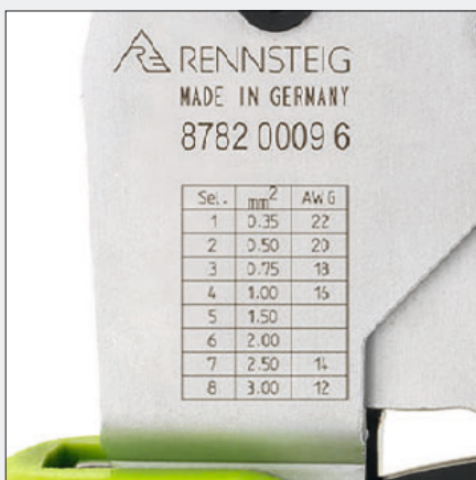
Selector position easily readable on the pliers