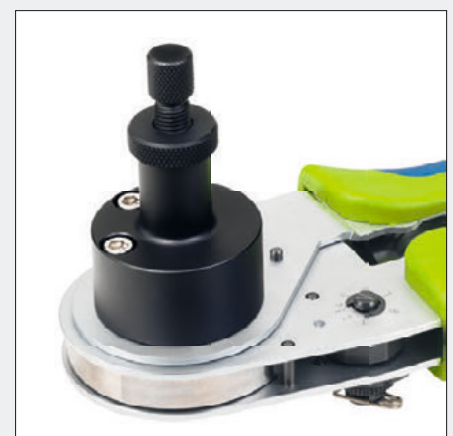
Supplied with universal locator