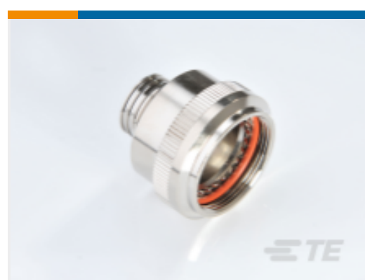
TE Part # 70H1-21-21-1-ZN 70H1-21-21-1-ZN