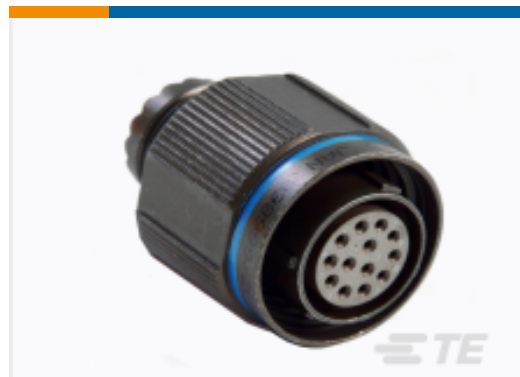
TE Part #YDTS26Z25-24PNV001 PLUG ASSY