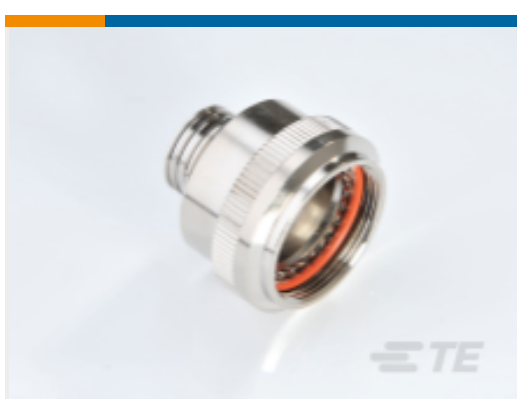
TE Part # 70H1-21-16-1-ZN 70H1-21-16-1-ZN