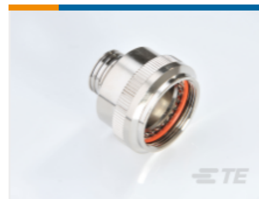
TE Part # EK4790-000 70H1-21-14-1-ZN