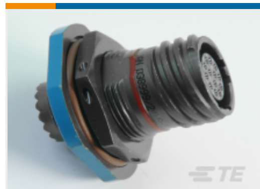
TE Part #YDTS24Z21-16SBV001 RECP ASSY