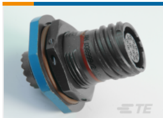
TE Part #YDTS24Z25-24PAV001 RECP ASSY