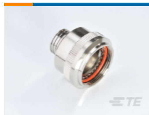
TE Part # 70H1-21-06-1-ZN 70H1-21-06-1-ZN