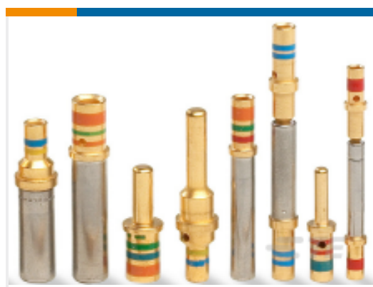
TE Part #1662-213-2031 CONT SOC ASSY