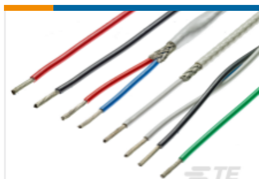
TE Part #075421-000 CXA-0078-20-3-9CS2405