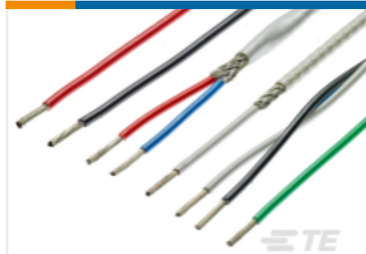
TE Part #A85364-000 WXA-0059-16-9CS2972