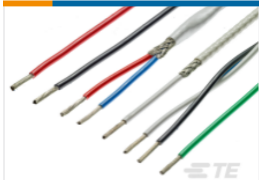
TE Part #140169-000 CXA-0078-22-2-9CS2405