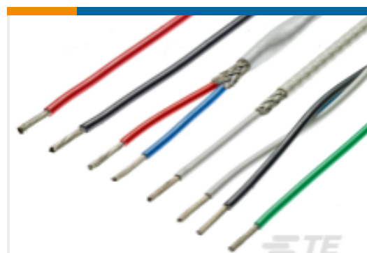
TE Part #889113-000 CXA-0078-18-1-9CS2405