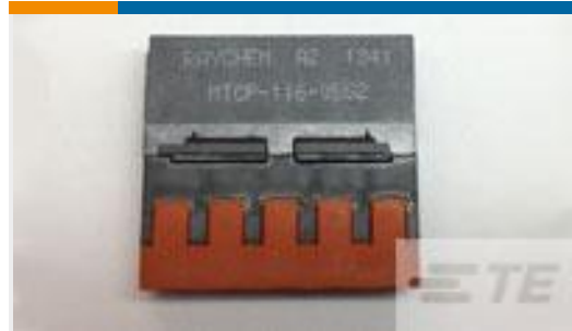
TE Part #674339-000 MTCP-116-05S2