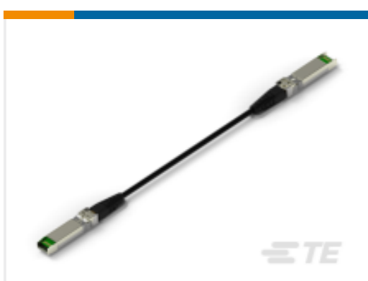
TE Part # 4-2334985-2 SFP56 DIRECT ATTACH CA, 1M, 32AWG