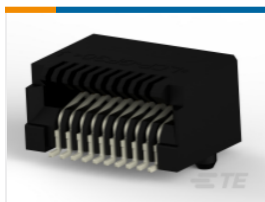
TE Part # CAT-SF59-C76264 SFP Connectors