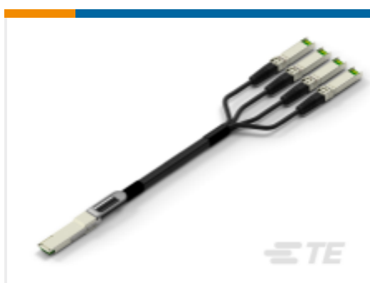
TE Part # CAT-C11-N490333 QSFP28-Four SFP+ Cable Assembly: 30 AWG