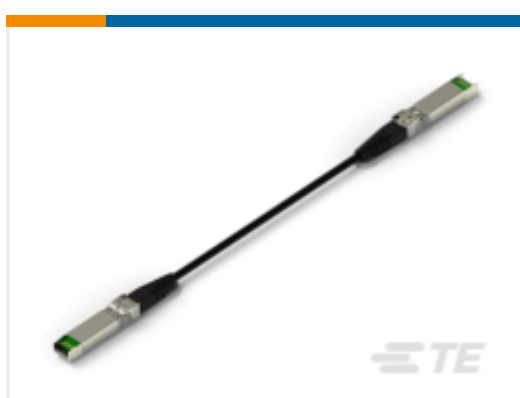
TE Part # CAT-C11-G28 SFP56 to SFP56 Cable Assembly: 26 AWG