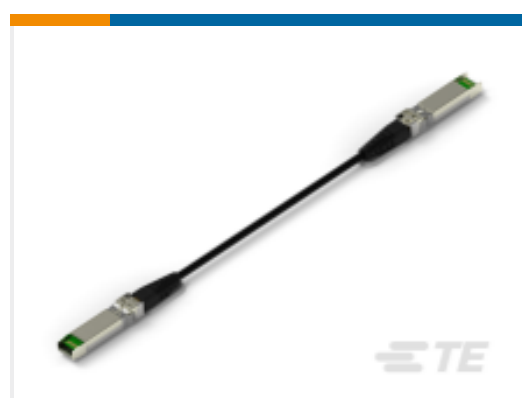
TE Part # CAT-C11-N4901142 SFP28 to SFP28 Cable Assembly: 32 AWG