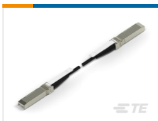
TE Part # CAT-C11-H50626 SFP+ to SFP+ I/O Cable Assembly: 30 AWG