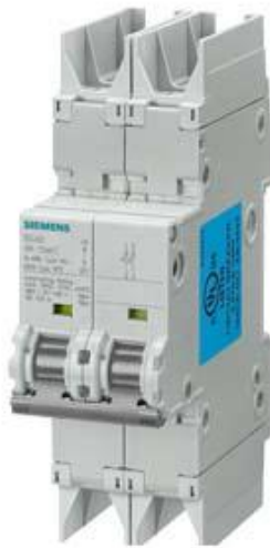
CIRCUIT BREAKER 10KA, 2POLE, D, 16A ACC. TO UL 489 - 480Y/277V