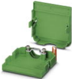
Cable housing, pitch: 3.81 mm, number of positions: 6, dimension a: 25.25 mm, color: green

Please be informed that the data shown in this PDF Document is generated from our Online Catalog. Please find the complete data in the user's documentation. Our General Terms of Use for Downloads are valid ( http://phoenixcontact.com/download )