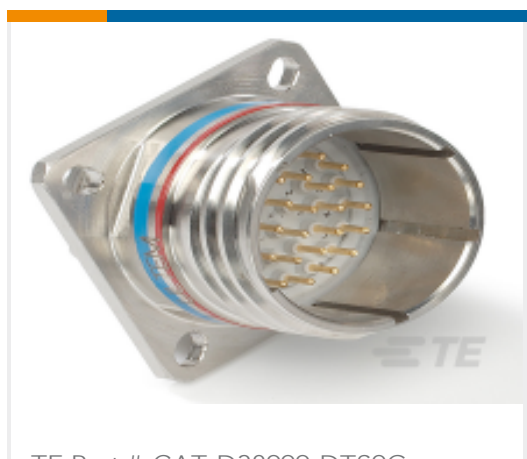
TE Part # CAT-D38999-DTS9G D38999: Square Flange, 25-19 insert