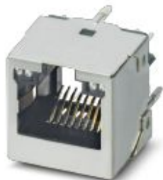
RJ45 socket insert, type: RJ45, degree of protection: IP20, number of positions: 8, 10 Gbps, connection method: Solder connection

Please be informed that the data shown in this PDF Document is generated from our Online Catalog. Please find the complete data in the user's documentation. Our General Terms of Use for Downloads are valid ( http://phoenixcontact.com/download )