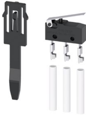
Auxiliary switch, 1 changeover contact, for Size NH00, accessory for fuse switch disconnecter 3NP1