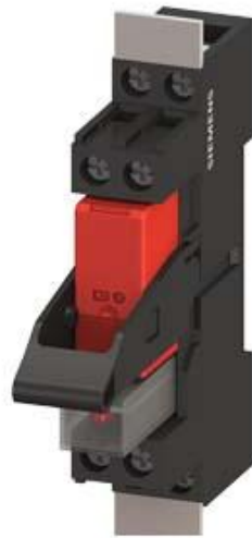
PLUG-IN RELAY COMPACT UNIT AC 230, 2 CO CONTACT LED MODULE RED STANDARD PLUG-IN SOCKET SCREW TERMINAL