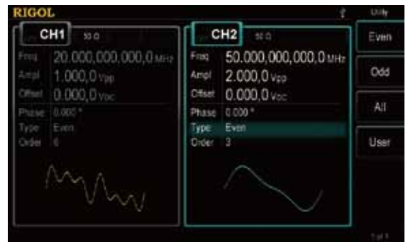
Up to 16 orders customized Harmonic generation function