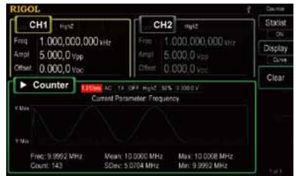
The statistic analysis function of counter