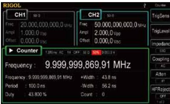
Standard high resolution counter function