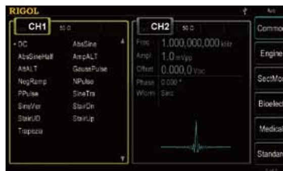
Arbitrary waveform function and built-in 150 waveforms