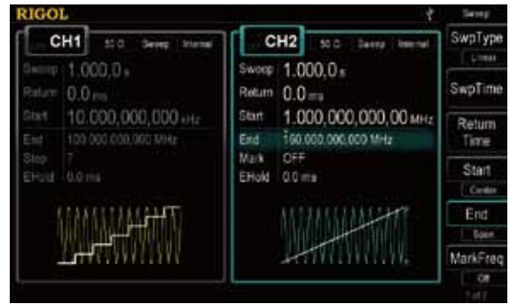
Various Sweep modes