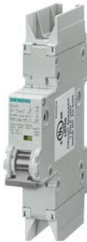
CIRCUIT BREAKER 10KA, 1POLE, C, 0.3A ACC. TO UL 489 - 277V