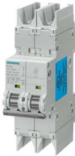
CIRCUIT BREAKER 10KA, 2POLE, C, 4A ACC. TO UL 489 - 480Y/277V