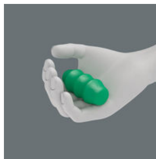
The basic idea for the prototype of the Kraftform handle – that the hand should dictate the design – has, right through to today, proved to be correct. In cooperation with the internationally recognised Fraunhofer IAO Institute, Wera developed a screwdriver handle designed to match the shape of the human hand as long ago as the 1960s. After a long development phase, the Wera Kraftform handle was launched to the market in 1968. It has been optimised through the years with new technologies, but has kept its proven shape. After all, the human hand has not changed either.