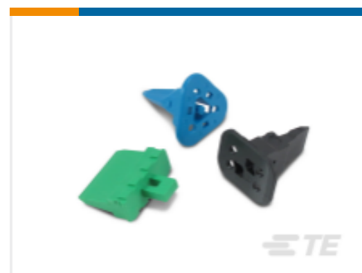
TE Part #W2S DEUTSCH DT WEDGELOCKS