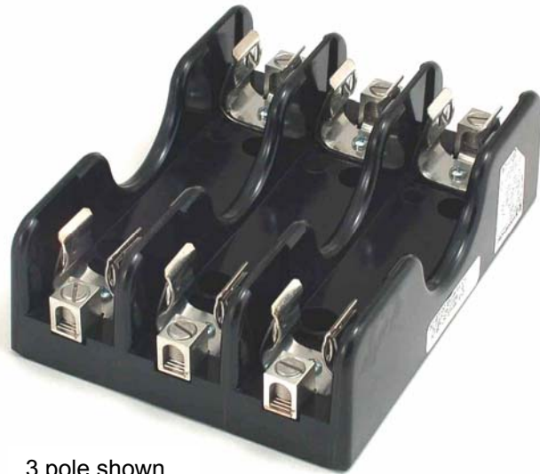
3 pole shown