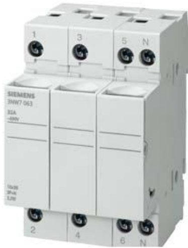
BUILT-IN FUSE BASE FOR CYLINDRICAL FUSES SIZE 10X38MM 32A, 3POLE