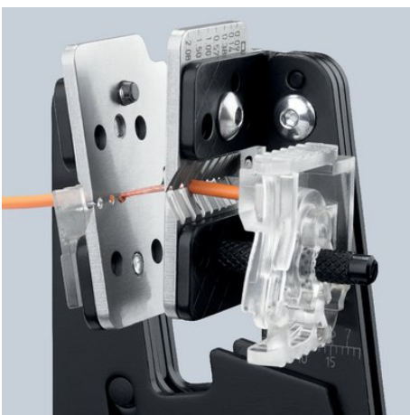
Positive stripping thanks to precise shape of the blades

Kapton® is a registered trademark of E. I. du Pont de Nemours and Company Radox® is a registered trademark of Huber & Suhner AG