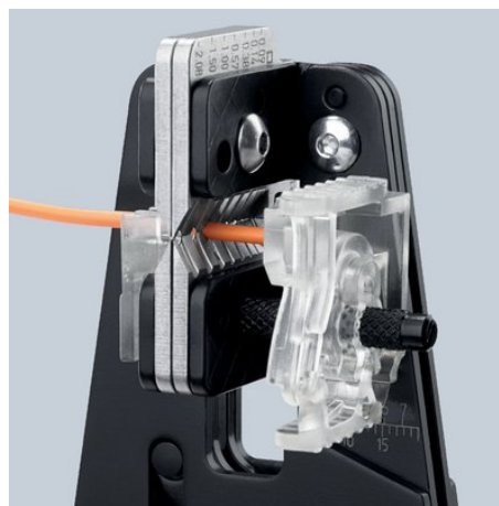
Precise cutting of the insulation to a complete extent