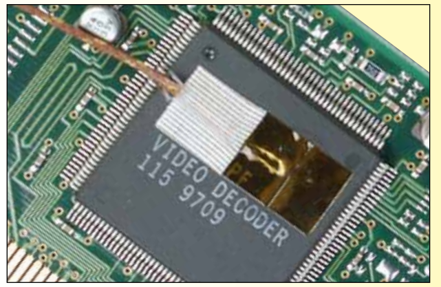
The self-adhesive mounting strip is ideal for "targeted" placement of the sensor element. Once the element is in place, it can be used "as is" for applications such as electronic component temperature monitoring during board fabrication. It can also be cemented in place using OMEGABOND® for higher temperatures.