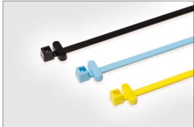
T50RFID – Cable ties with RFID transponder.