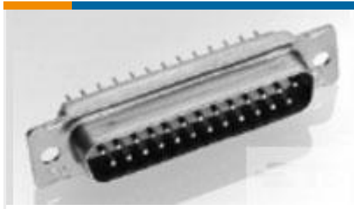
TE Part #205558-2 AMPLIMITE,ASY,PLUG,STD,109,2