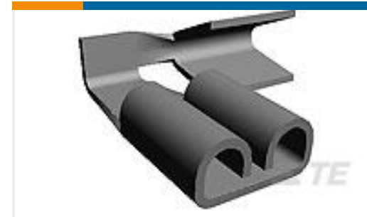
TE Part #62321-1 110 FASTON FLAG REC 22-16 AWG TPBR