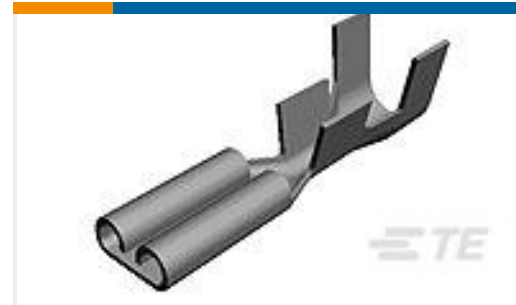
TE Part #42067-1 110 FATON REC 24-22 AWG TPBR