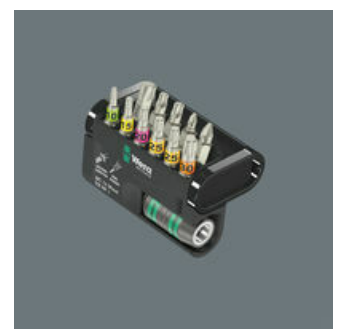
The Bit-Checks can be positioned upright at the workplace so the tool is always quickly to hand.