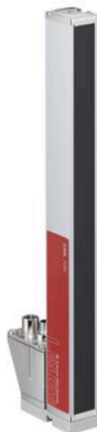
Figure can vary

Part no.: 50119191 CML730i-R20-1270.R/L-M12 Light curtain receiver