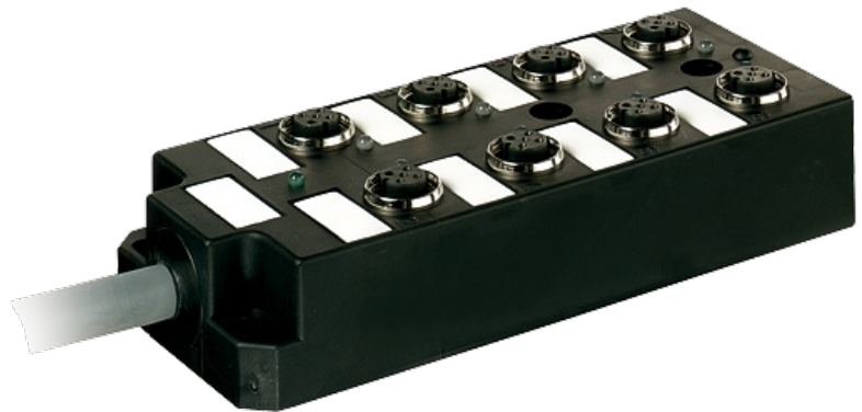
M12 Females 5-pole