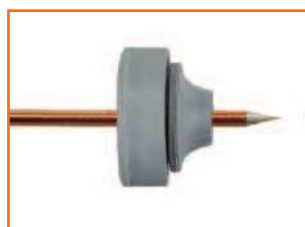
2. The dowel pin is inserted into the opening on the front of the LTB and pushed through the membrane