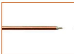
1. A sharpened dowel pin is selected—slightly smaller than the wire diameter