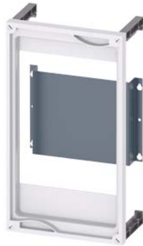
A400/630 MOUNTINGKIT H=450 W=251 X 3NP1143 (NH1) AT MOUNTING PLATE