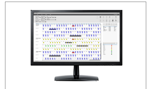
TimeMoto PC Software Plus Art.no: 139-0600