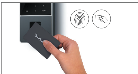
Clocking with RFID proximity card, Fingerprint or PIN code

* After the 30-day trial, choose your subscription: TimeMoto Cloud or TimeMoto Cloud Plus