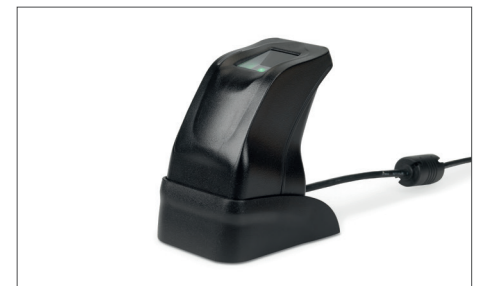
TimeMoto FP-150 USB Fingerprint Reader Art.no: 125-0606