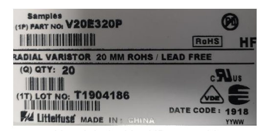
New label with cURus marking

Affected Product Series: HB34, HF34, HG34, DHB34, HA, RA, UltraMOV 25S, LA, CIII, UltraMOV, LV UltraMOV, HMOV, AUMOV, ZA Varistor Series. Please see attached the affected part number list.