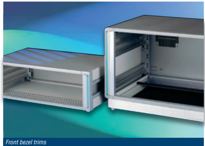
Front bezel trims