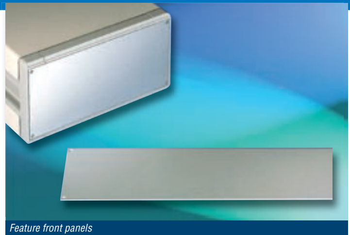
Feature front panels